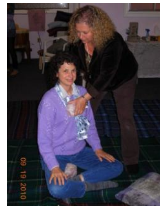
Keeping balanced during training.

Get answers as well as advertising ideas for your RET practice on the RET Technician Support Forum.